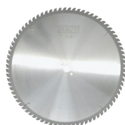
SAW DISC FOR DRY CUTTING