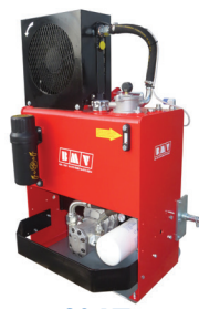
80 LT. TANK