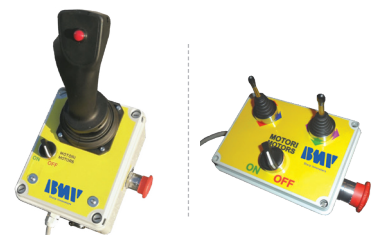
JOYSTICK AND CONTROL BOX