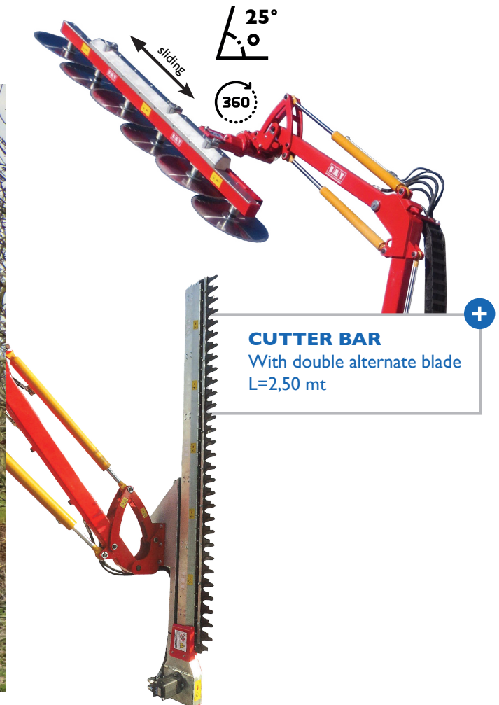
CUTTER BAR With double alternate blade L=2,50 mt