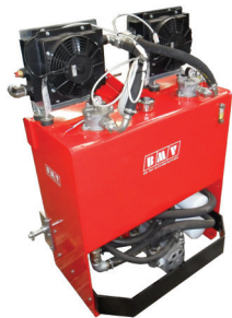
120 LT. TANK