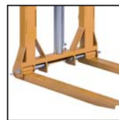
Adjustable and pliable forks