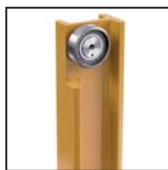
Straight roller radial bearings