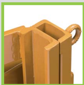
Hot-rolled steel profiles