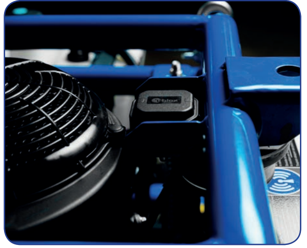
GPS Compass Servo Drive